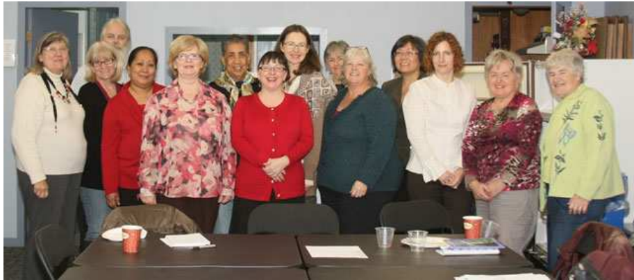
East York Garden Club Board for 2012